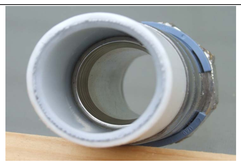
Inlet side from plastic pipe The strengthener inside acts like a reducing bush followed by a short taper.

32mm connector fitted direct to commissioning station