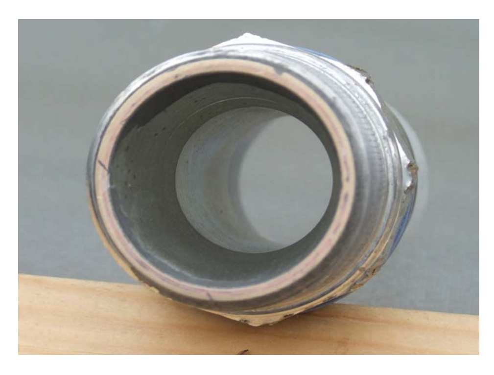
Discharge side into commissioning station Taper out to the commissioning station connection